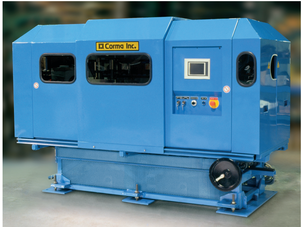
Model I30 illustrated*

10 McCleary Court Concord (Toronto) Ontario, Canada L4K 2Z3 Tel.: (905) 669-9397 Fax: (905) 738-4744 Internet: http://www.corma.com E-mail: info@corma.com